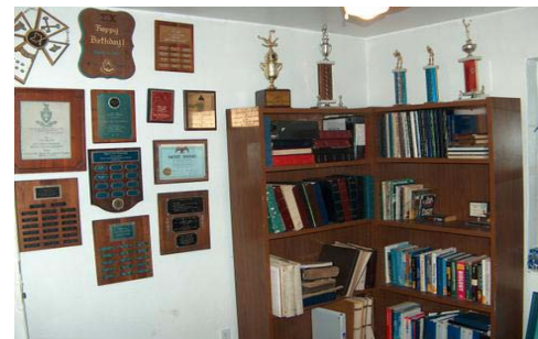
A picture of the new library with photo albums, books, and awards all organized to be more presentable. A new desk is also to be installed.