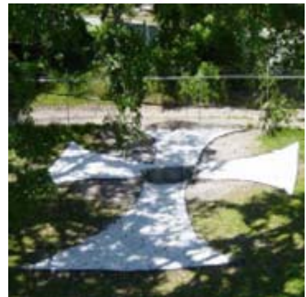
White Cross fire pit situated at the back of the house and created by brother Brett Miller '05