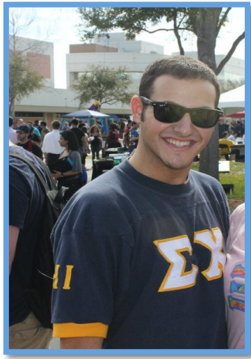
Eta Iota's 2012 Consul